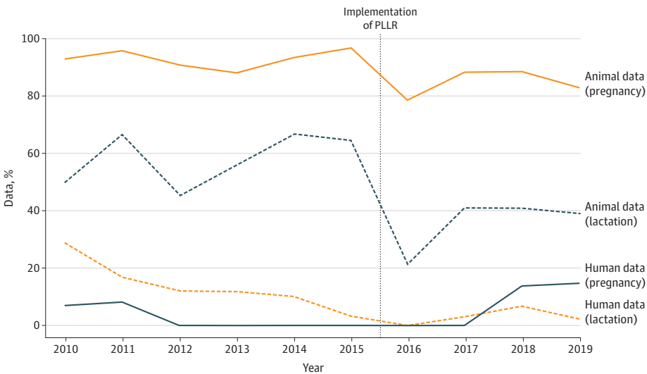
Figure 2. Pregnancy and Lactation Data Derived From Human and Animal Studies Before and After Implementation Date

The amount of human and animal data for pregnancy and breastfeeding ranged from year to year. The amount of pregnancy and lactation-specific data derived from human research ranged from 0% to 28% and 0% to 8%, respectively. The amount of pregnancy and lactation-specific data derived from animal research ranged from 79% to 100% and 39% to 68%, respectively. The Pregnancy and Lactation Labeling Rule (PLLR) was implemented June 30, 2015.